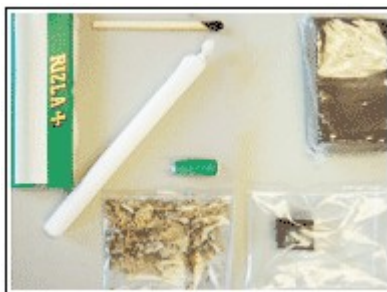
Cannabis and smoking materials