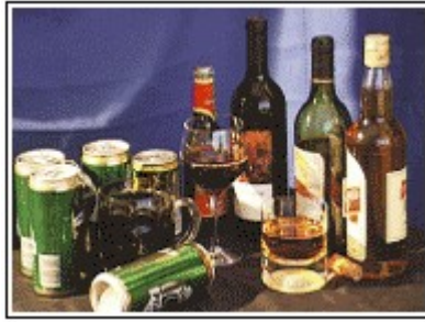
Some alcoholic drinks

Solvents, cannabis and heroin are also depressants.