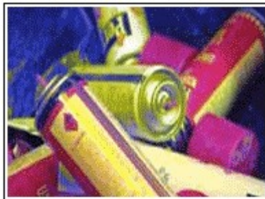
Cans containing solvents