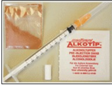
Heroin and needle

Some of the long-term effects of depressants on the body include damage to the liver, brain and heart. They can also have the following effects: